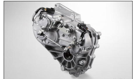
Gearbox Housing / Cooling System