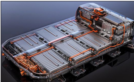
Battery Pack Housing / Cooling System

Autonomous all-in-one solution that provides quick and accurate results for leak testing.