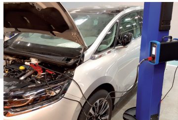
Used Car Inspection (UCI)