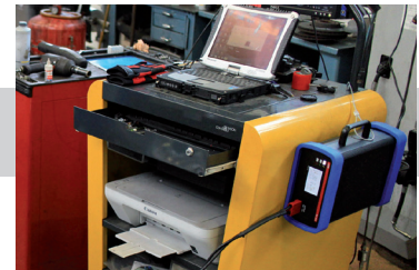
Power supply maintainer