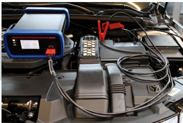
Pre Delivery Inspection (PDI)